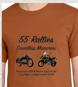
Mens Texas Orange