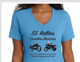
Womens Aquatic Blue