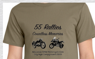
Mens Dusty Brown