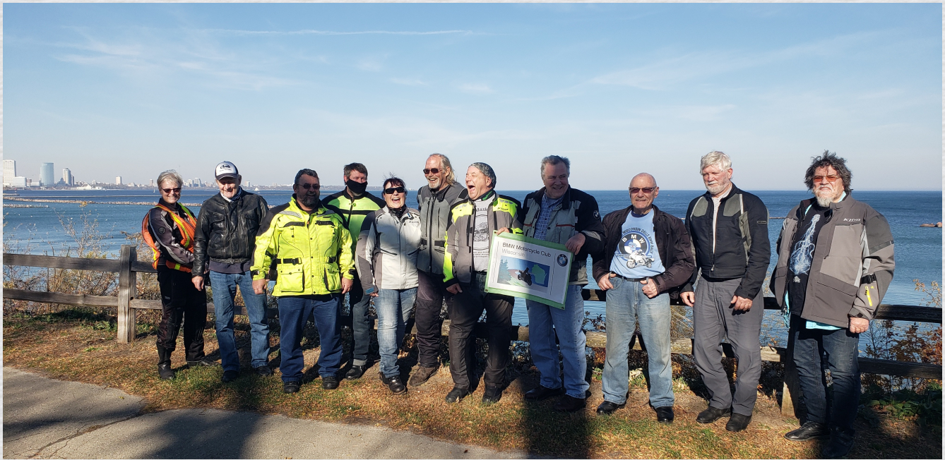
Blast from the past! President's Closing ride November 2020