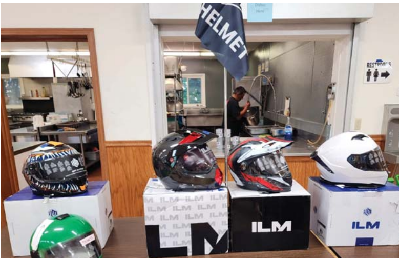
Above: ILM Helmets donated FOUR Helmets. Two were raffled off; Two were given away as Door Prizes.